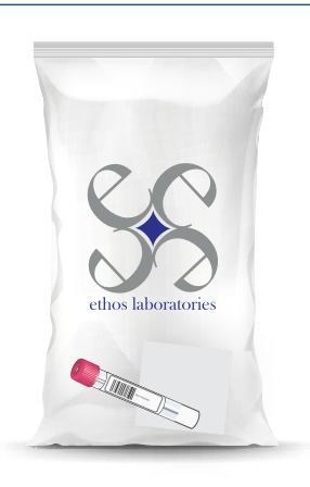
Place vial in specimen bag and seal bag