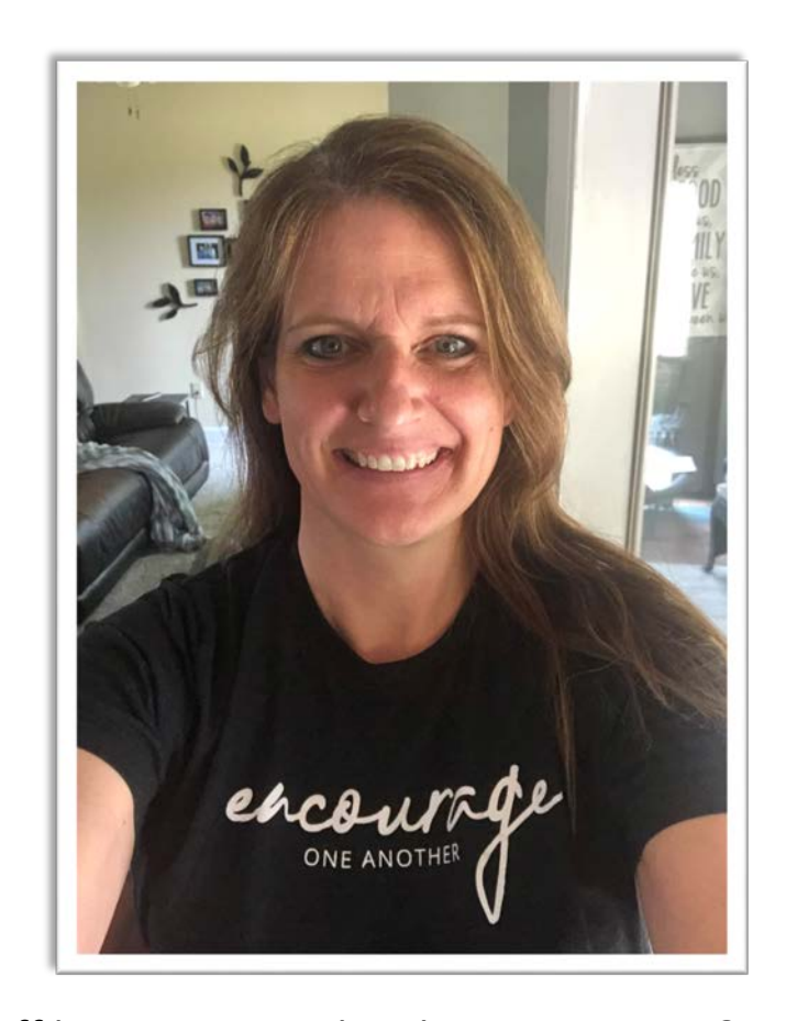
Staff liaison to Membership Committee & Awards Committee